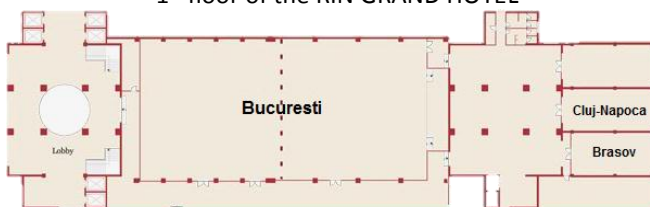
1 st floor of the RIN GRAND HOTEL

The acces to the outdoor parking and multifloor garage is on the right side of the building.